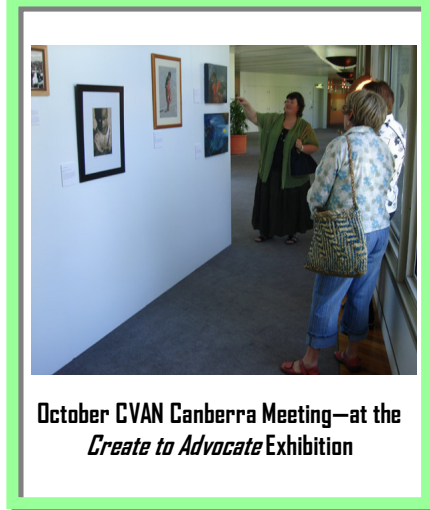
October CVAN Canberra Meeting—at the Create to Advocate Exhibition